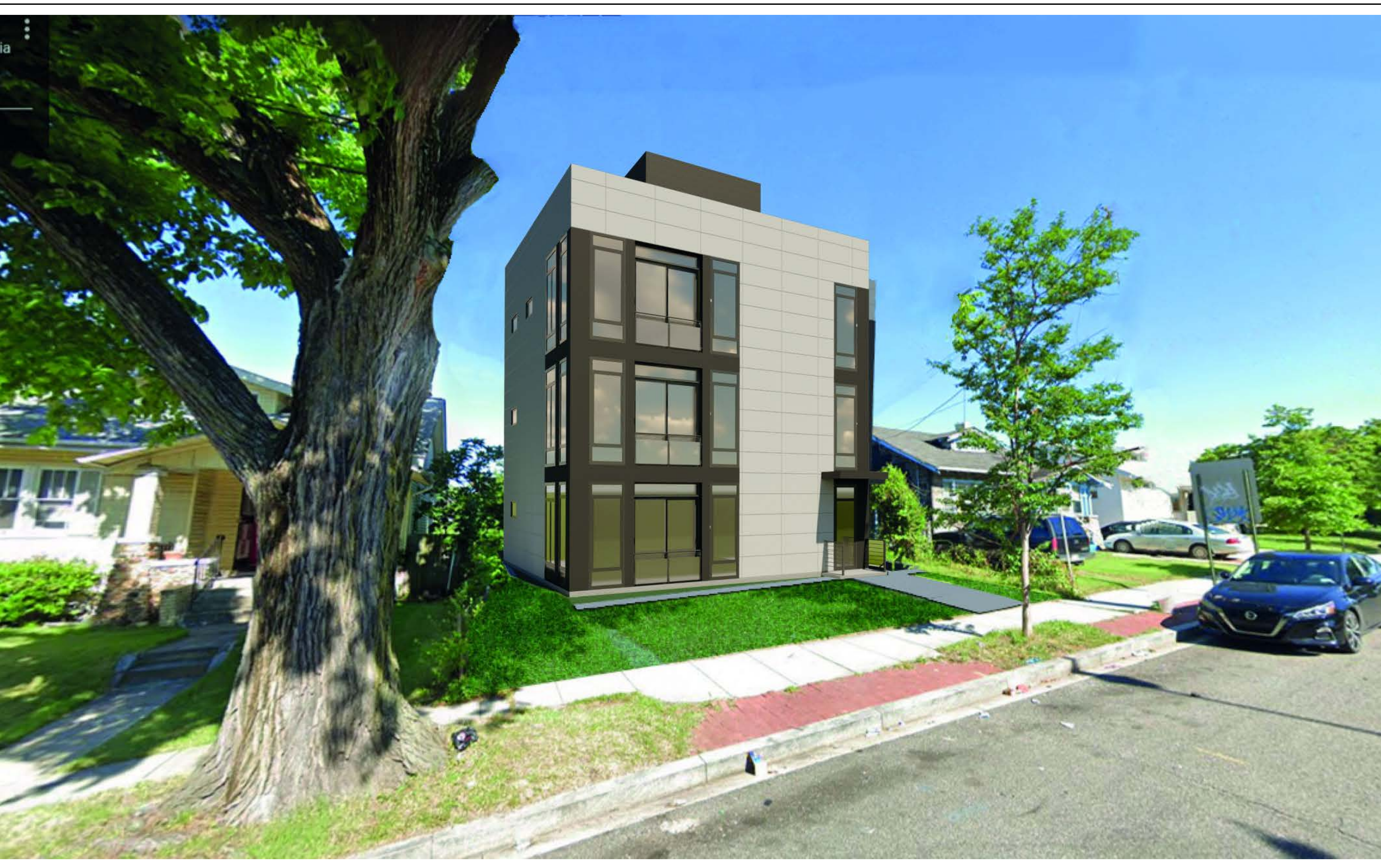
1 Visualization Front Elevation